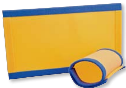
Shown is the construction of EKS-1 – EKS-5.