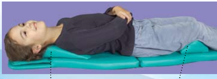
The Rainbow Head Tilt

The Rainbow® Head Tilt and Knee Support help keep the upper torso lifted, and the head in a “chin up” position, while the knee support relieves pressure on the lower back. Both items have a non-slip bottom.