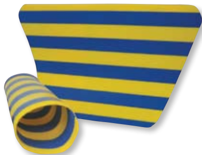
Shown is the construction of EKS-5L – EKS-7.