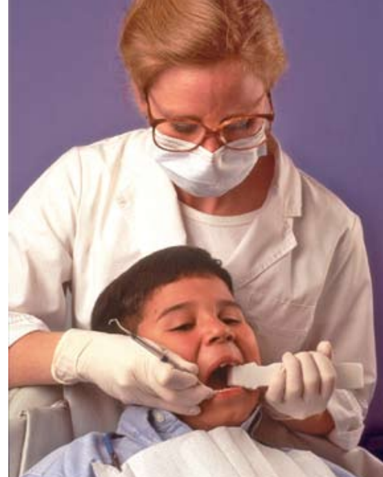
The Thick Mouth Rest has 40% more foam.

Important: Consult the appropriate authority in your state or facility for regulations that may pertain to the use of mouth rests.